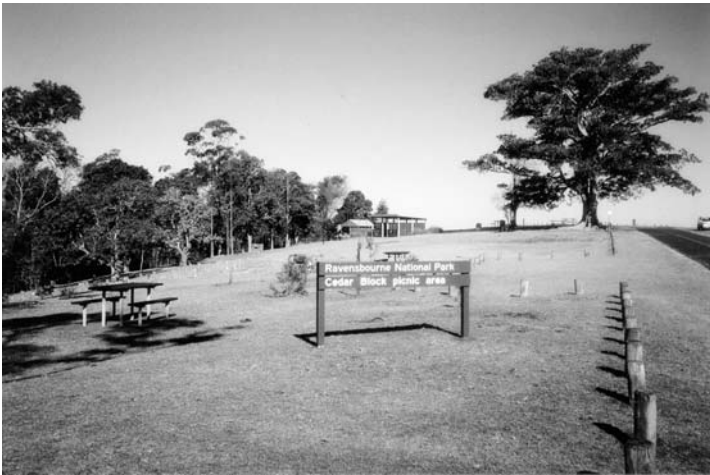
Picnic grounds at Beutel's Lookout